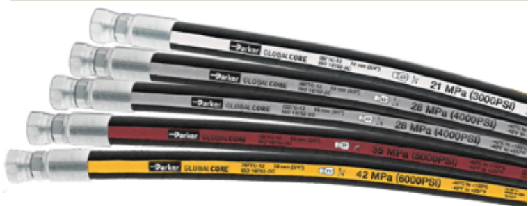
We Crimp From 0.25" up to 2.00"