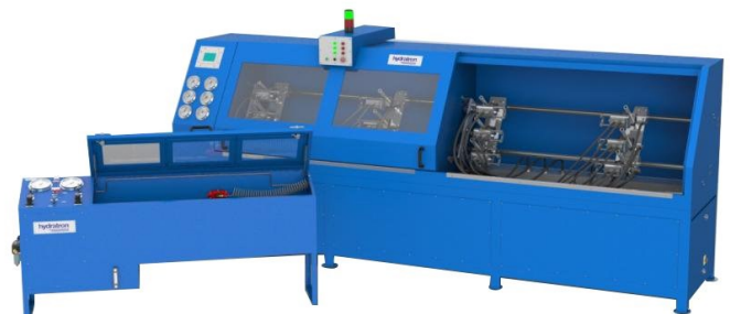
Leak Test up to 50,000 PSI