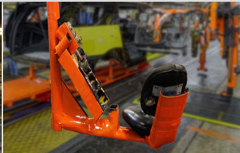
Cover automotive installation equipment to prevent damage. Provided as a kit or custom application.

Proven Cost Savings of up to $300K per year!