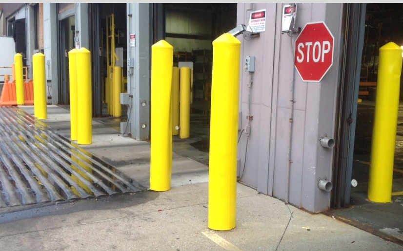
Custom fit Bollard Covers of polyurea foam fit over existing ballard cover.

Want to significantly reduce wasted & damaged material? Exotic Automation & Supply's In-System Damage Protection, ISD, uses a high grade neoprene foam rubber, coated with a high performance grade polyurea with a hardness rating of 80A and is proven not to damage Class A surfaces.