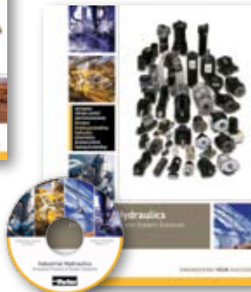
Industrial Bulletin HY01-1001/US