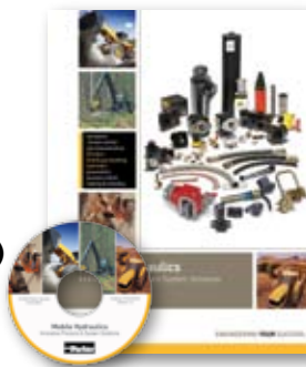
Mobile Bulletin HY19-1012/US