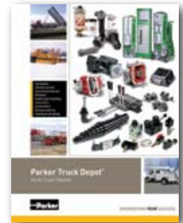
Truck Bulletin HY19-TD01/US

Parker has available a set of Hydraulic Product Catalogs for industrial, mobile and truck markets, each paired with an interactive CD. Call 800-CParker to order any or all of these comprehensive guides.