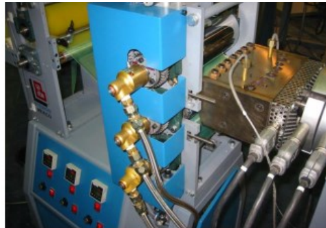
Heated Rolls Plastics