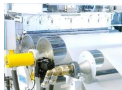
Plastic Film or Sheets