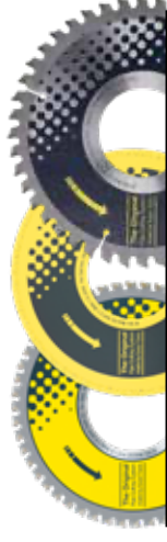
Cermet 165, Diamond 165, TCT P190